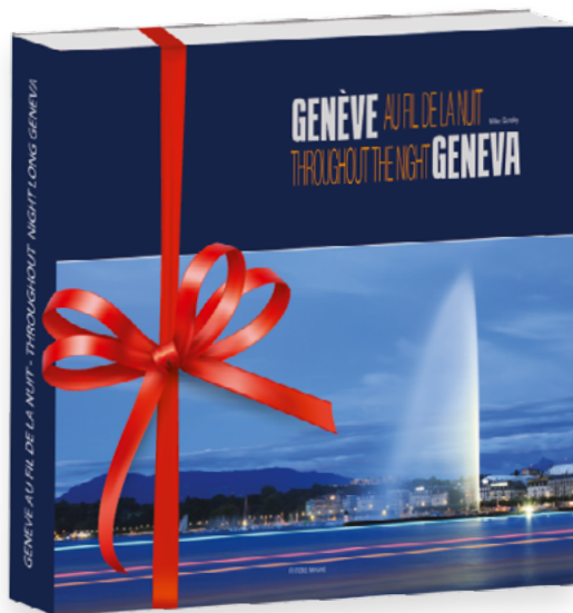
« GENÈVE AU FIL DE LA NUIT, GENEVA THROUGH THE NIGHT »